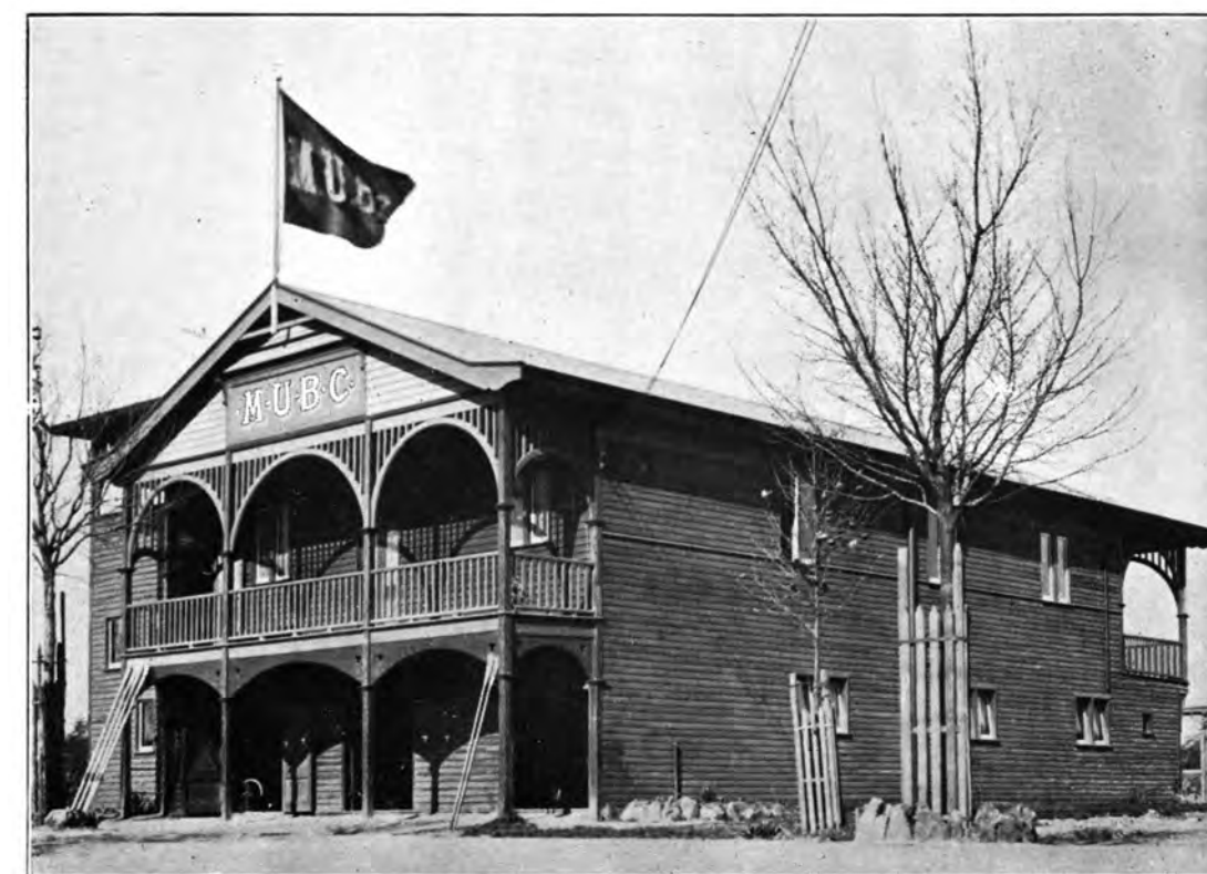
THE NEW BOATHOUSE - BUILT 1909

Our history includes many stories of generous supporters and each year our coaches and administrative staff work hard to ensure high standards are maintained. However, in the modern world, we need to adapt our practices in order to sustain and improve the club.